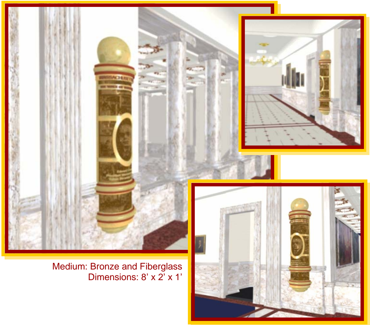
Medium: Bronze and Fiberglass Dimensions: 8' x 2' x 1'

The top hemisphere, the banding half rings and bottom cap are cast fiberglass with a gold leaf or gold acrylic finish. The core relief semi-cylinder is cast bronze.